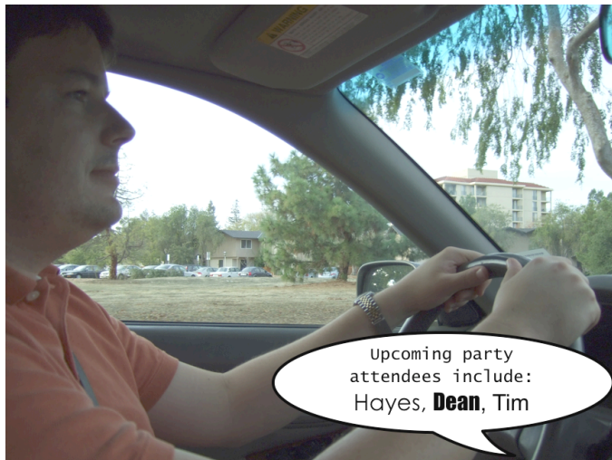
Figure 1. Example use case scenario for the audio priming system

Information gathering for upcoming events is not a new idea [2], but many interface design questions remain open. The audio priming system differs from prior work in (1) its use of an audio interface optimized for the demands of mobile, inter-event contexts and (2) its inclusion of information and modes of presentation designed for more than explicit information transfer.